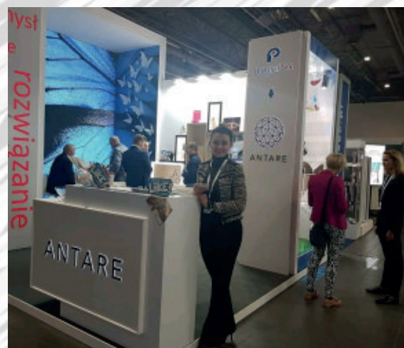
RETAIL SHOW 2019