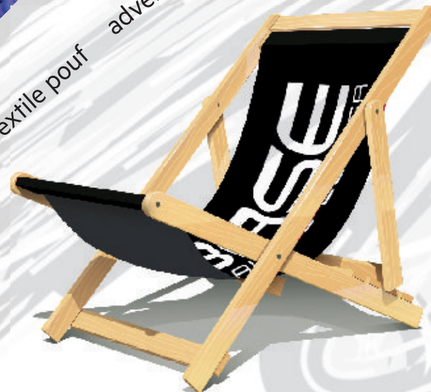
advertising reclining chair textile stand