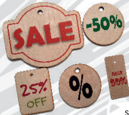
signage and communication hangers