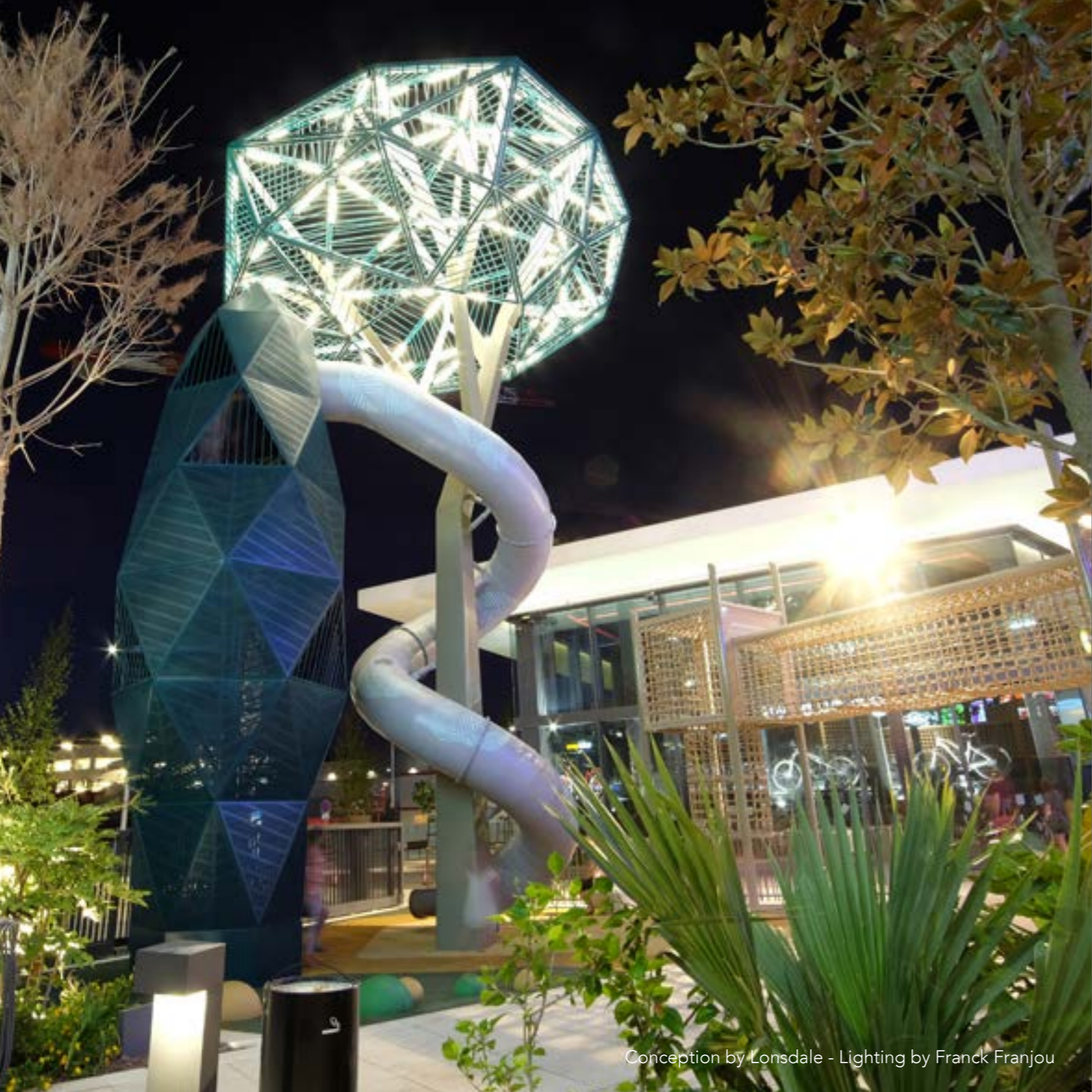
Conception by Lonsdale - Lighting by Franck Franjou