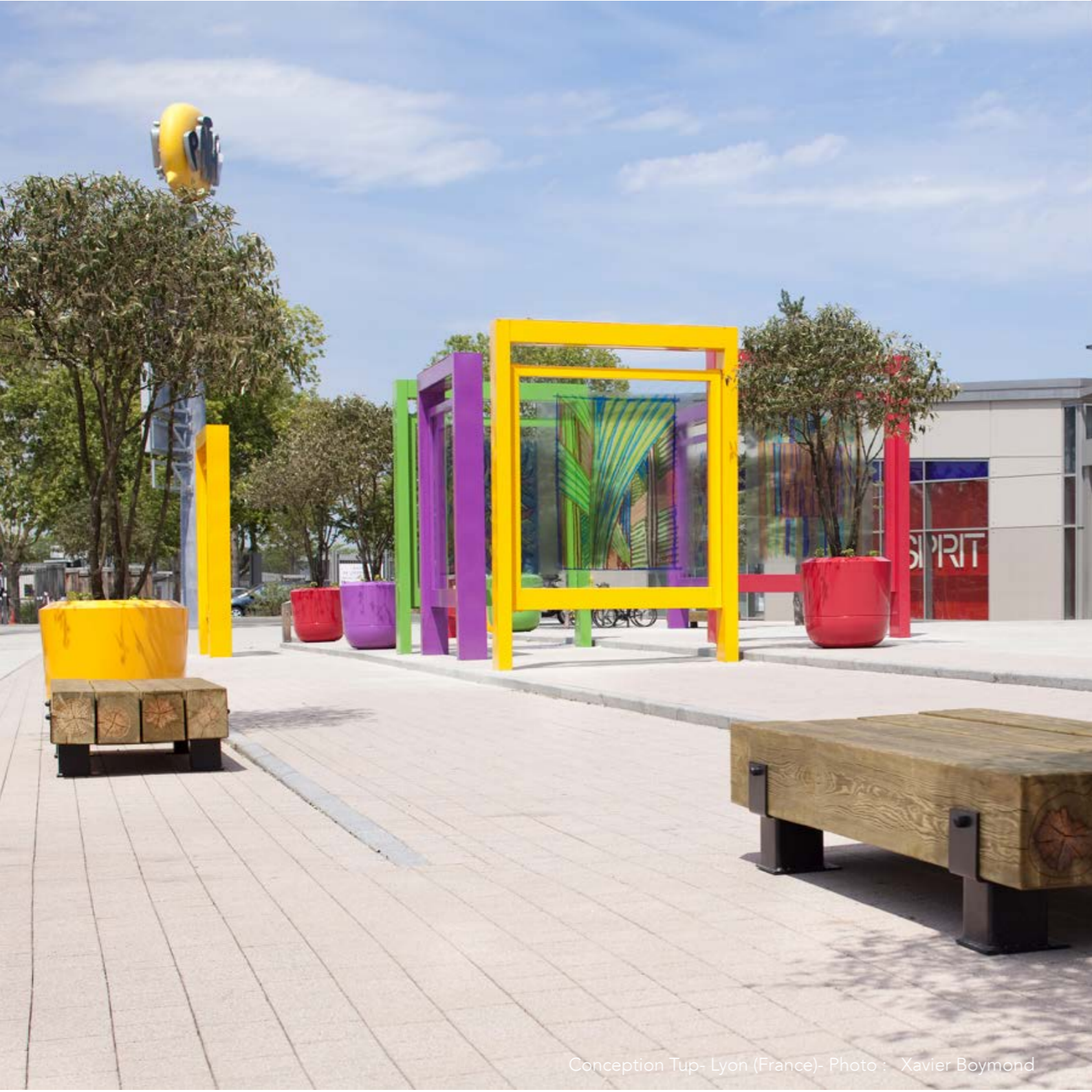
Conception Tup- Lyon (France)