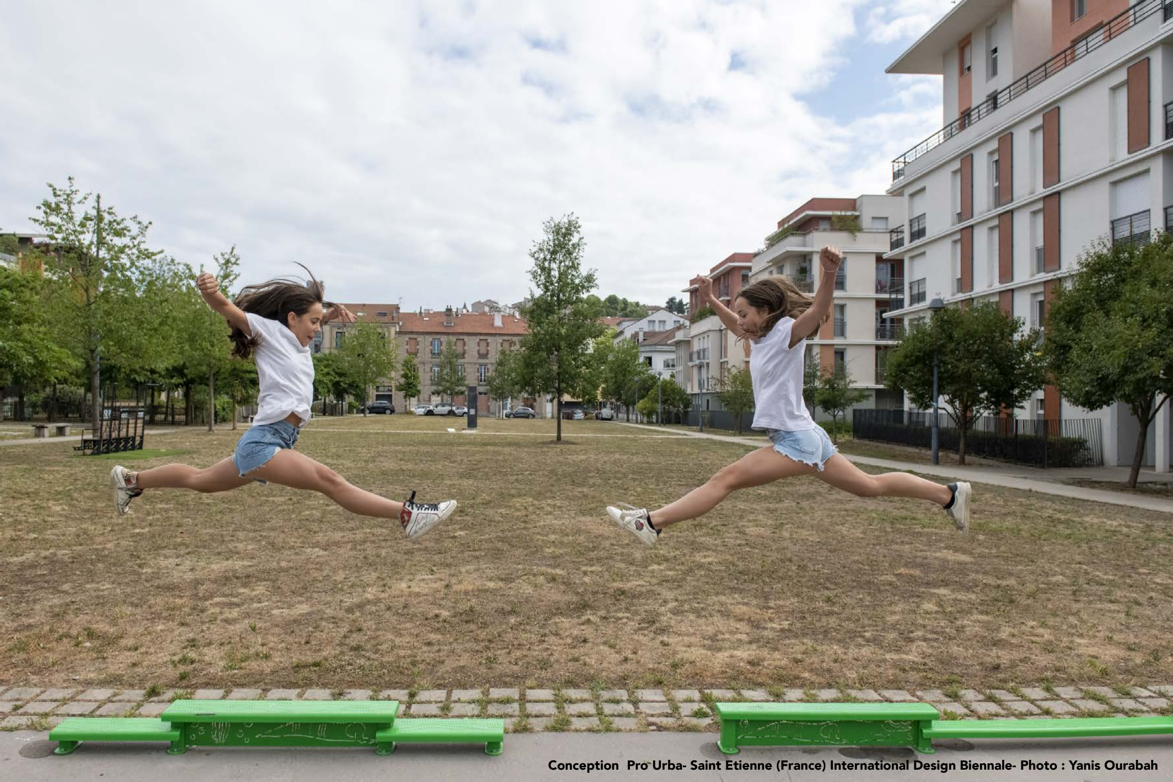
Conception Pro-Urba- Saint Etienne (France) International Design Biennale