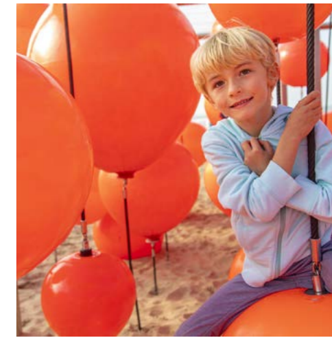
Conception by Basel and realisation by Pro Urba- Moulins (France)