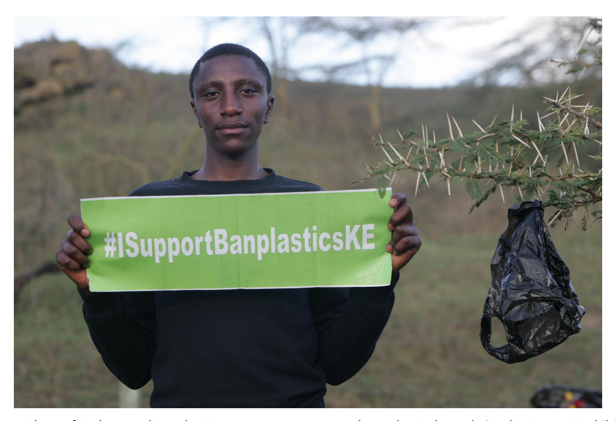
A resident of Nakuru asking the Kenyan government to ban plastic bags

This strategy outlines the framework for better solid waste management, including plastic waste management, across the major municipalities: Kisumu, Eldoret, Thika, Mombasa, and Nakuru.