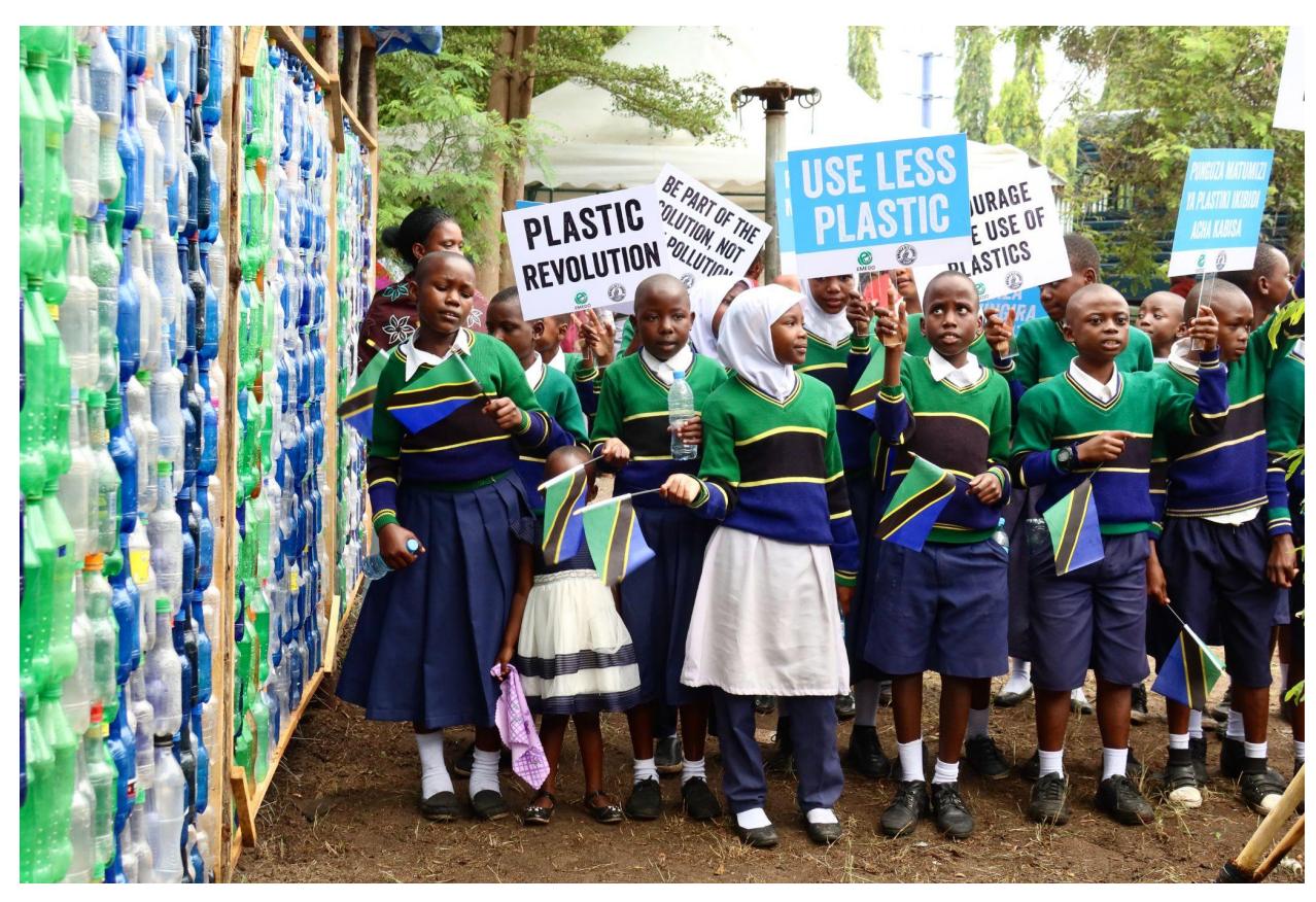
School children in Mwanza hold up signs calling for a plastic revolution