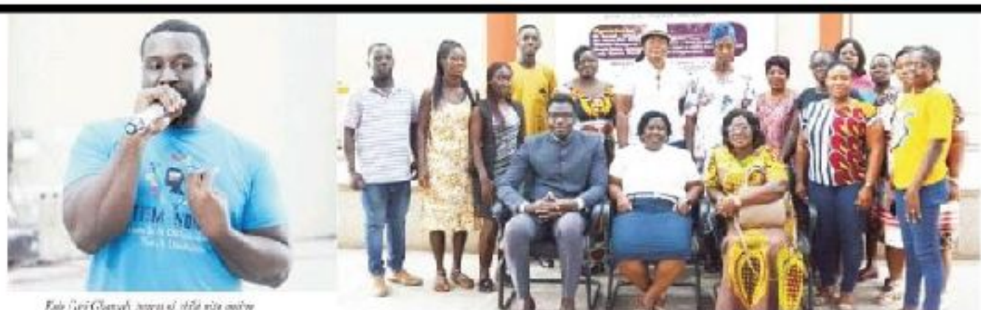
Edem Kodjo, Health Minister, speaking at the West Africa Pharma Healthcare Exhibition.

The 2nd edition of the West Africa Pharma Healthcare Exhibition is set to kick off next month in Accra, Ghana. The exhibition is organized by the Ghana Association of Pharmaceutical Manufacturers (GAPMA) in collaboration with the Ministry of Health and the Ministry of Trade and Industry. The exhibition will feature a wide range of pharmaceutical products and services, including drugs, medical devices, and diagnostic equipment. It will also provide a platform for industry stakeholders to network and explore potential collaborations. The exhibition is expected to attract a large number of visitors, including government officials, industry representatives, and healthcare professionals. It is a significant event for the pharmaceutical industry in West Africa and is expected to contribute to the growth and development of the sector.