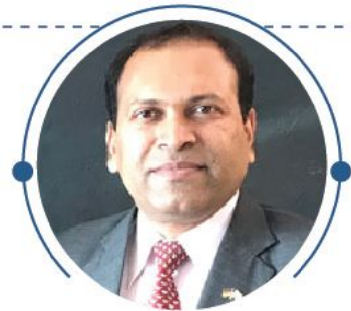
H.E. Mr. Sugandh Rajaram High Commissioner of India to Ghana

Indian High commissioner to Ghana H.E. Mr. Sugandh Rajaram commended the organizers for organizing such an exhibition for manufacturers and distributors in Ghana. He stressed that the relationship between Ghana and India cannot be overemphasized and added that the event will go a long way to strengthen the good relationship between Ghana and India.