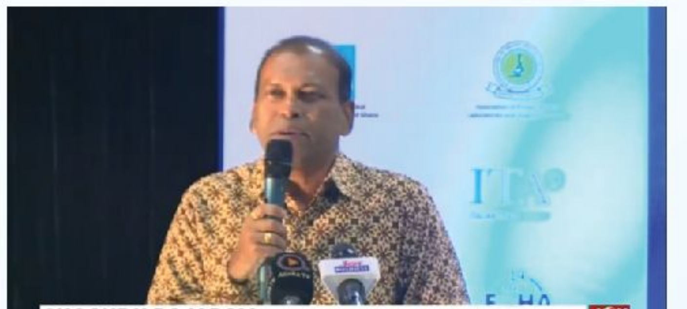
SUGANDH RAJARAM Indian High Commissioner

The 2nd Edition of the West Africa Pharma Healthcare Exhibition (WAPHC) was held in Accra, Ghana, from May 16th to 18th, 2023. The exhibition was organized by Wegvoras, an Indian-based company, in collaboration with the Ministry of Health (MOH) and the Ministry of Trade and Industry. The exhibition featured a wide range of pharmaceutical products and services, including drugs, medical devices, and diagnostic equipment. It provided a platform for industry stakeholders to network and explore potential collaborations. The exhibition was a success and attracted a large number of visitors, including government officials, industry representatives, and healthcare professionals. It is a significant event for the pharmaceutical industry in West Africa and is expected to contribute to the growth and development of the sector.