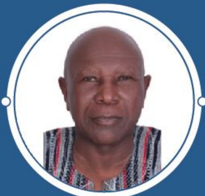
Hon Mahama Asei Seini Deputy Minister, Ministry of Health

The West Africa Pharma Healthcare exhibition was official inaugurated and open to public and business visitors in Accra Ghana on the 16th May 2023 in Accra Ghana by the Deputy Minister of Ministry of Health Hon Mahama Asei Seini & High Commissioner of India to Ghana H.E. Mr. Sugandh Rajaram.