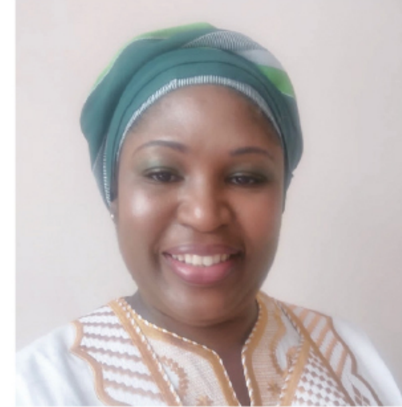
BULLI GUINEVERE AOAEH