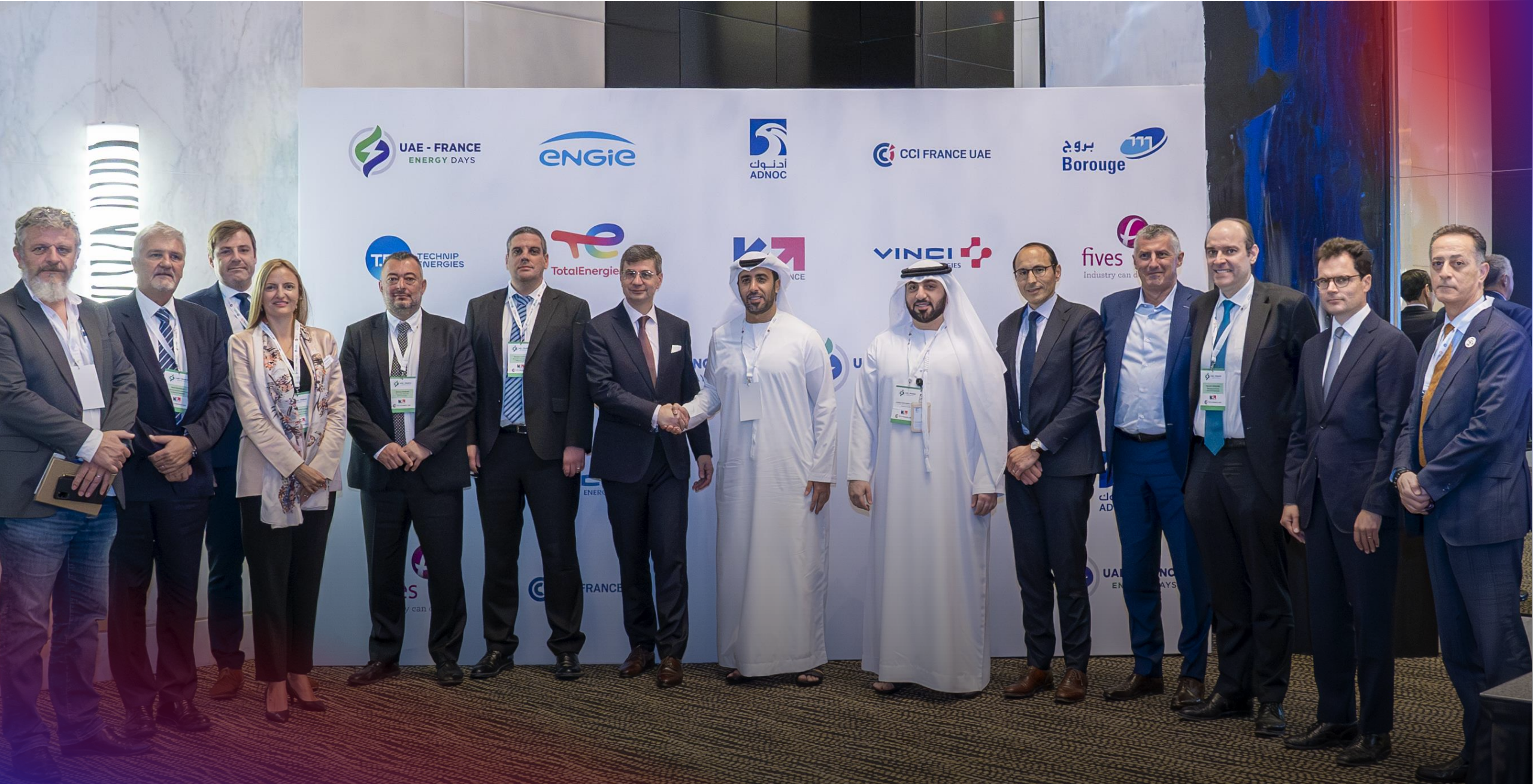
2023 : 7 th edition of the UAE-France Energy Days