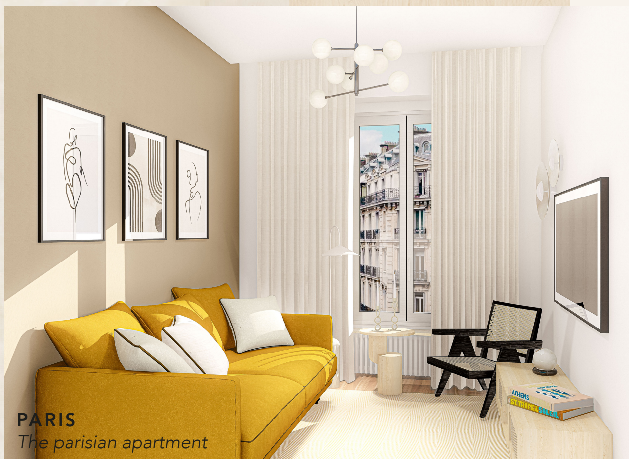
PARIS The parisian apartment

Between Scandinavian decoration and contemporary design, this small Haussmann apartment brings warmth and conviviality. Each object in this space brings its originality and merges into a modern space.