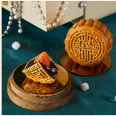
CHINESE JUJUBE WITH SALTED EGG YOLK