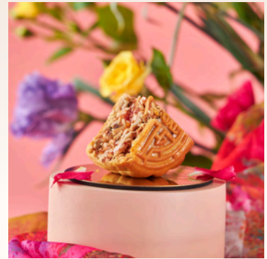
FIVE WHOLE GRAINS, NUT AND DRIED FRUIT

Mooncakes will be available for pick-up starting 10 August 2025 at The Bakery, lobby floor at The Athenee Hotel, Bangkok