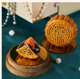
CHINESE JUJUBE WITH SALTED EGG YOLK