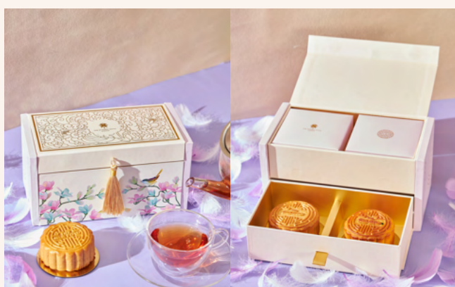
Athenee Enchanted Box