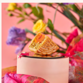
MONTHONG DURIAN WITH SALTED EGG YOLK