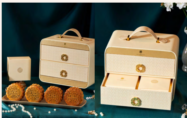
Athenee Signature Box