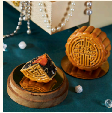
BLACK SESAME WITH SALTED EGG YOLK