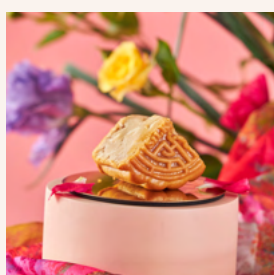
WHITE LOTUS SEEDS