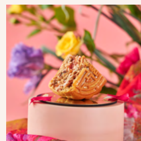
FIVE WHOLE GRAINS, NUT AND DRIED FRUIT

Mooncakes will be available for pick-up starting 10 August 2025 at The Bakery, lobby floor at The Athenee Hotel, Bangkok