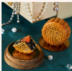
BLACK SESAME WITH SALTED EGG YOLK