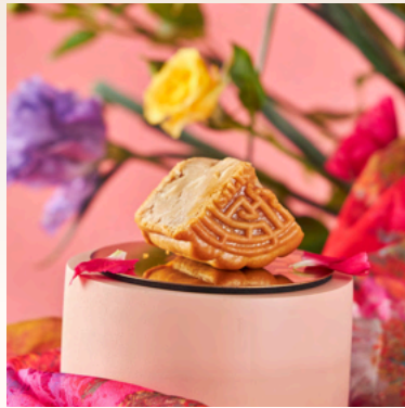
WHITE LOTUS SEEDS