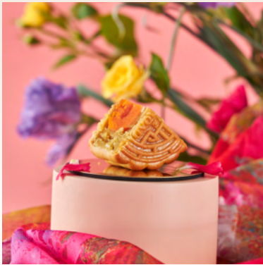
MONTHONG DURIAN WITH SALTED EGG YOLK