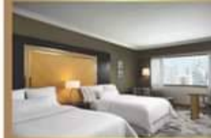
Family Package (80 Sqm.)