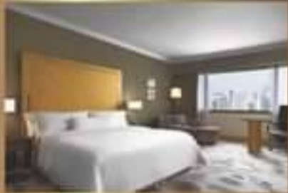
Deluxe Room (40-45 Sqm.)