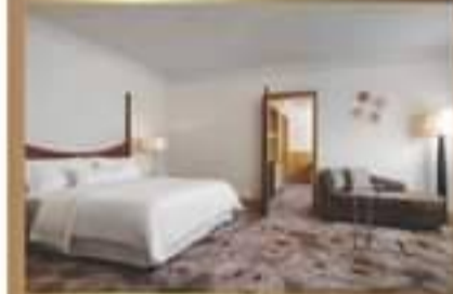
Deluxe Suite (70 Sqm.)