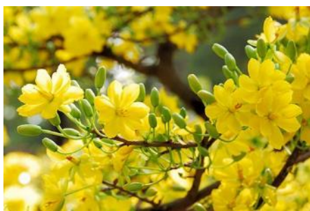
Hoa Mai (Ochna Intergerrima)

Hoa Đào (peach blossom) is more common in the North as it can grow in the dry and cold weather. It is used to ward off evil spirits during the Tết celebrations.