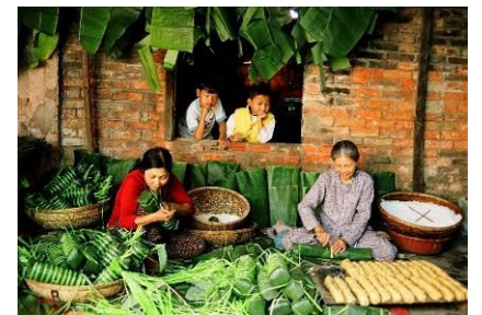
Preparing Bánh Chưng