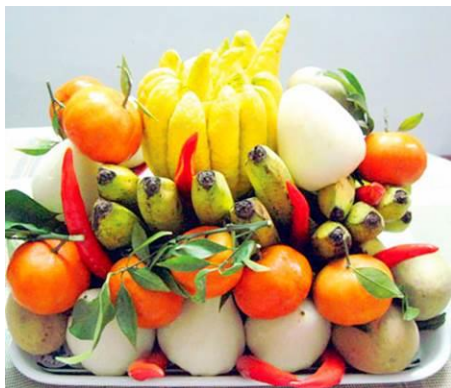
Fruit offering in the North include kumquats, bananas, oranges and Buddha hands.

Vietnamese families traditionally lay out a tray of 5 fruits at the altar called “Mâm Ngũ Quả”. The fruits are colorful and meaningful. Asian mythology, the world is made of five basic elements: metal, wood, water, fire and earth. The plate of fruits on the family altar at New Year is one of the several ways to represent this concept. It also represents the desire for good crops and prosperity.