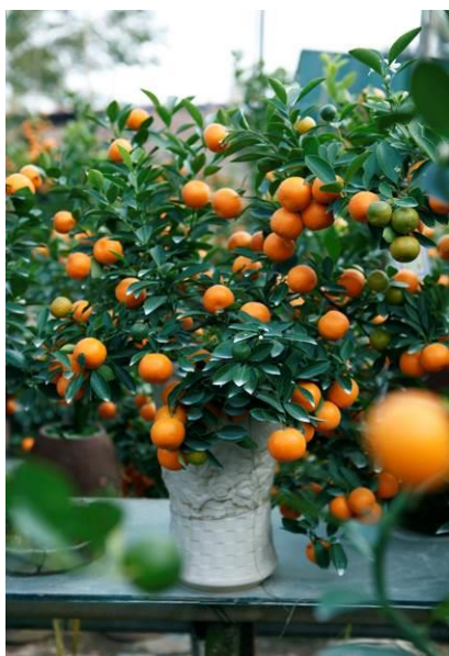
Cây Quất (Kumquat Tree)

Like a "family tree", the Kumquat plant symbolically represents the many generations of a household. The fruits are grandparents, the flowers are parents and the buds and green leaves are children. Kumquat plants should be carefully selected for their symmetrical leaves, color and shape of fruit.