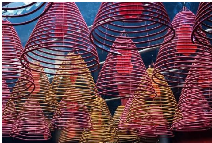
Burning incense in Chinese Temple District 5 (a piece of paper is attached to the incense, prayer writes name of the deceased or those who they are praying for).

Floating Flower Market: The Crescent Mall, Dist. 7, from 7pm, 8 Feb to 14 Feb Spring" with traditional country Vietnamese food and flower market and Vietnamese traditional music performance every night.