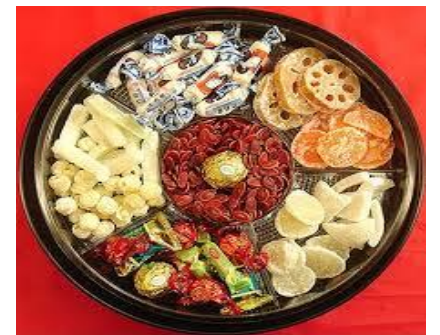
Mứt (dried fruit)