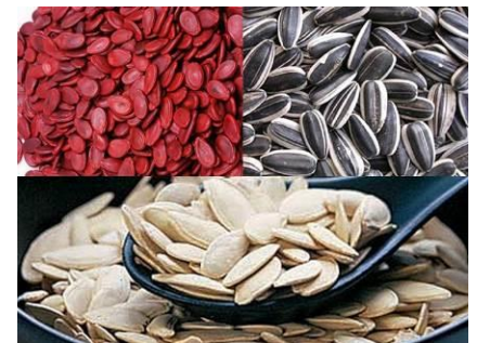
Hạt Dưa, Hạt Bí, Hạt Hường Dương (roasted seeds).