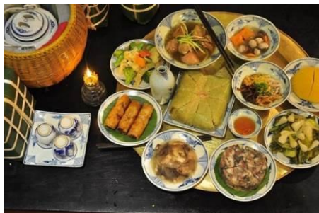
A typical meal offering to ancestors.

Vietnamese families traditionally lay out a tray of 5 fruits at the altar called “Mâm Ngũ Quả”. The fruits are colorful and meaningful. Asian mythology, the world is made of five basic elements: metal, wood, water, fire and earth. The plate of fruits on the family altar at New Year is one of the several ways to represent this concept. It also represents the desire for good crops and prosperity.