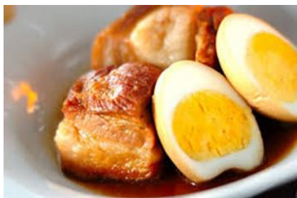
Thịt Kho Tàu (meat stewed in coconut juice)