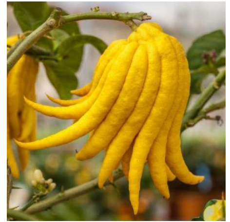
Quả Phật Thủ, (Buddah's Hand) fruit, considered good luck.