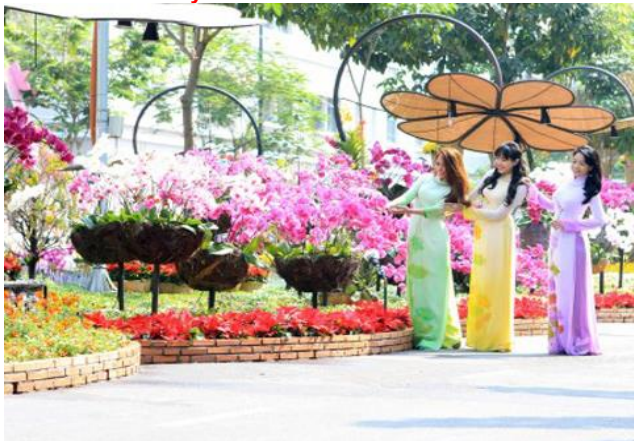
Flower Display on Nguyen Hue Street in Ho Chi Minh City

Tết Flower Markets: located in more than 125 places in Ho Chi Minh city, the biggest ones are at 23/9 Park (Pham Ngu Lao Street near Ben Thanh Market, Dist.1), Gia Dinh Park (corner of Nguyen Kiem Street and Nguyen Thai Son Street, Binh Thanh Dist.) and Le Van Tam Park (corner of Hai Ba Trung Street and Dien Bien Phu Street, Dist.3) from 08 to 15 Feb.