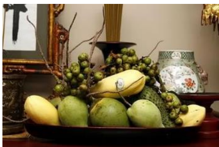
Fruit offering in the South include custard apples, coconuts, papayas, mango and goolar fig. In Vietnamese they are “Cầu, Dừa, Đủ, Xoài, Sung” which in the South literally is a prayer to “have enough to use” in the New Year.