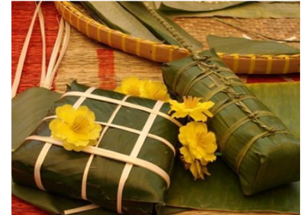
Bánh Chưng and Bánh Tét

Thịt Kho Tàu : "Meat Stewed in Coconut Juice", a traditional dish of pork belly and medium boiled eggs stewed overnight in a broth-like sauce, often eaten with pickled bean sprouts and chives and white rice.