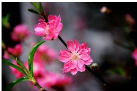
Hoa Đào (Peach Blossom)

Hoa Đào (peach blossom) is more common in the North as it can grow in the dry and cold weather. It is used to ward off evil spirits during the Tết celebrations.