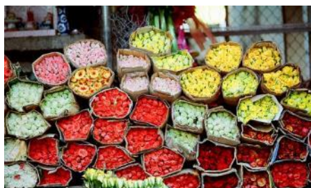
Ho Thi Ky Flower Market (open all year)

Similar to the pine tree for Christmas holiday in the West, Vietnamese also use many kinds of flowers and plants to decorate their homes for the holiday. Traditional plants include the Hoa Đào (Peach Blossom), Hoa Mai (Ochna Integerrima) and Cây Quất (Kumquat Tree). These plants represent coziness and prosperity. Other flowers may be displayed too.