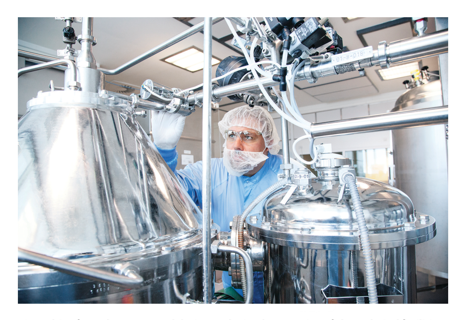
Consulting from the conceptual design to the implementation of the technical facilities used in the comprehensive processes that characterises the biopharmaceutical field.