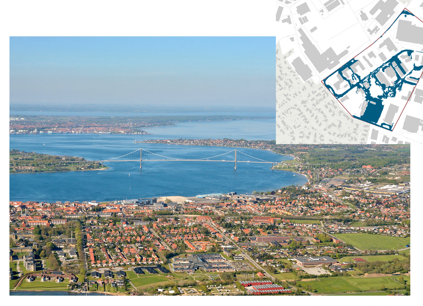
Climate-proofing against flooding