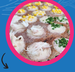
Coconut Rice Pancake (Mae Boon Song)