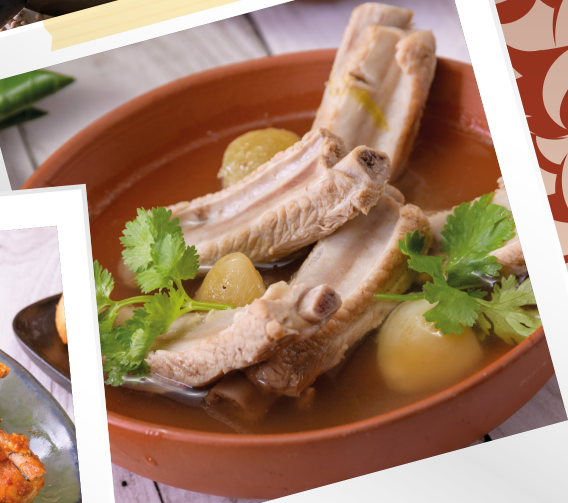
Bak Kut Teh with Yu Tiao