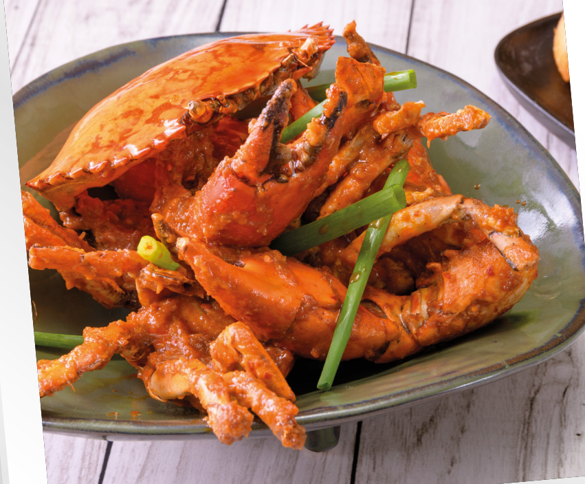
Singapore Chilli Crab

Available every Sunday from 7 to 28 August 2022!