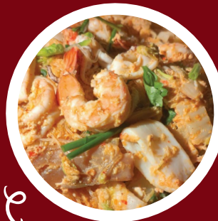
Elvis Suki (Soi Yotse) (Michelin BiB Gourmand 2018-2023)