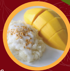
Khao Niao Mamuang