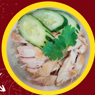
Singaporean Chicken Rice