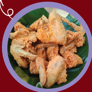
Fried Chicken: Fah (Bangkok's Famous Street Food)