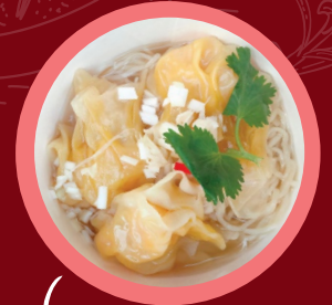
Cantonese Shrimp Wonton Noodle Soup