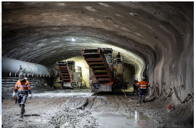
M6 Stage 1 tunnels under construction