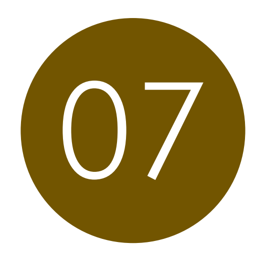
Support for entrepreneurship