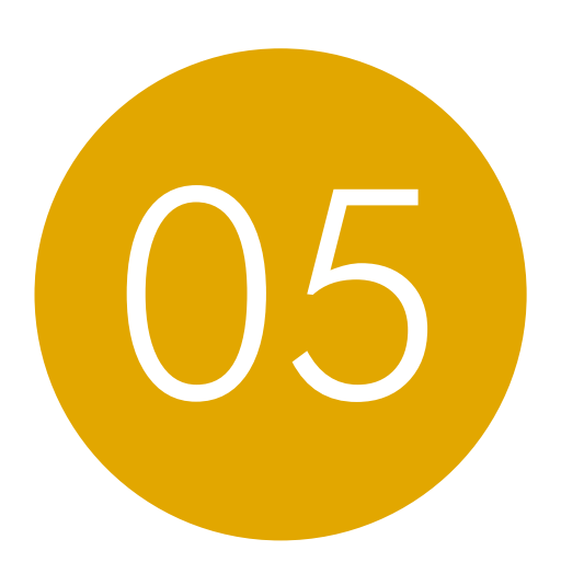
A new tax reality