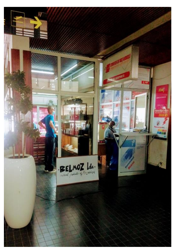
Belmoz shop International Airport