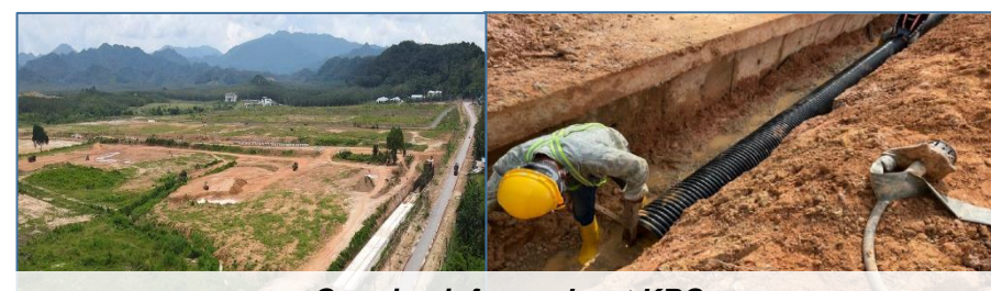
Ongoing infra works at KRC

Chapter 06 Improving Regional Balance and Inclusion Strategy