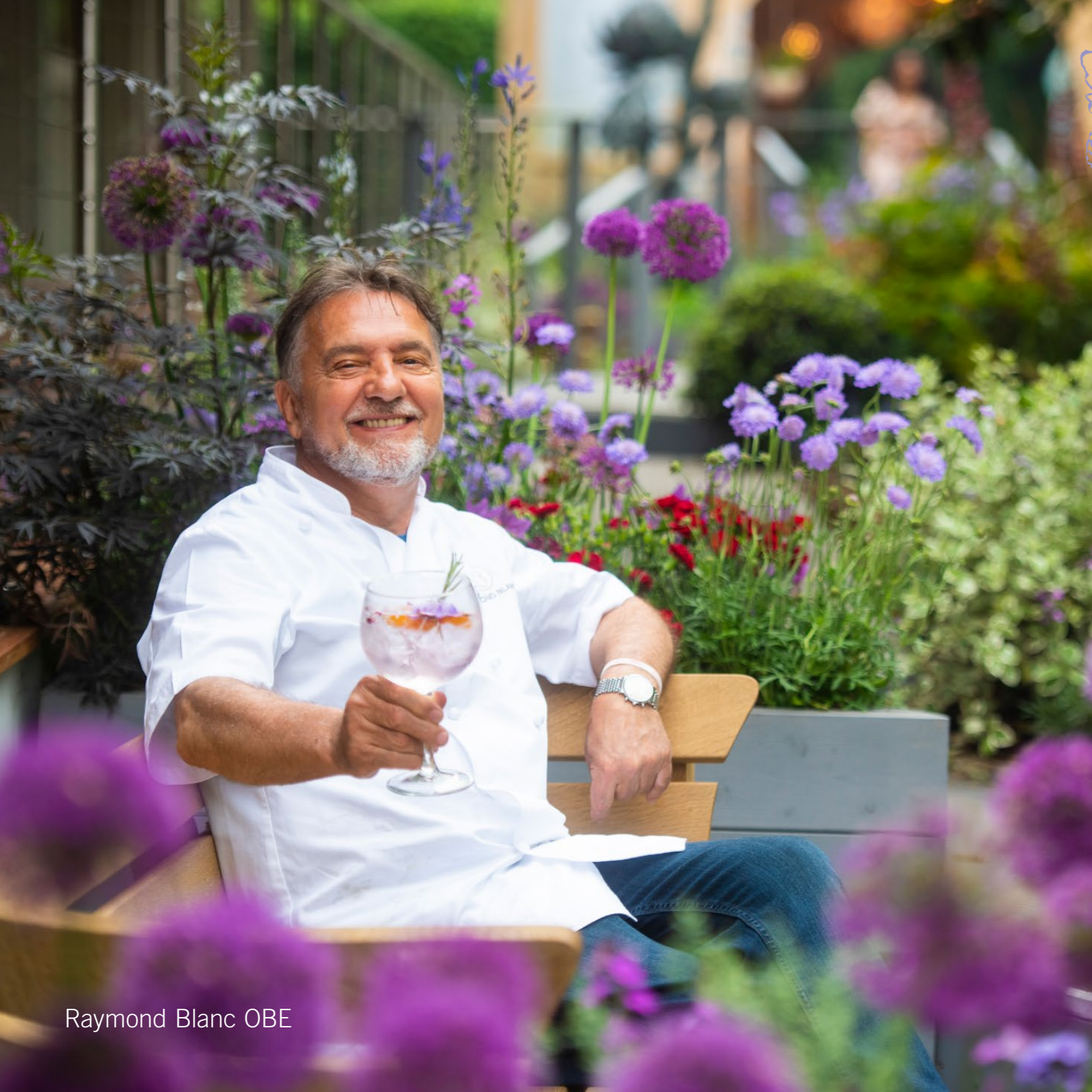
Raymond Blanc OBE