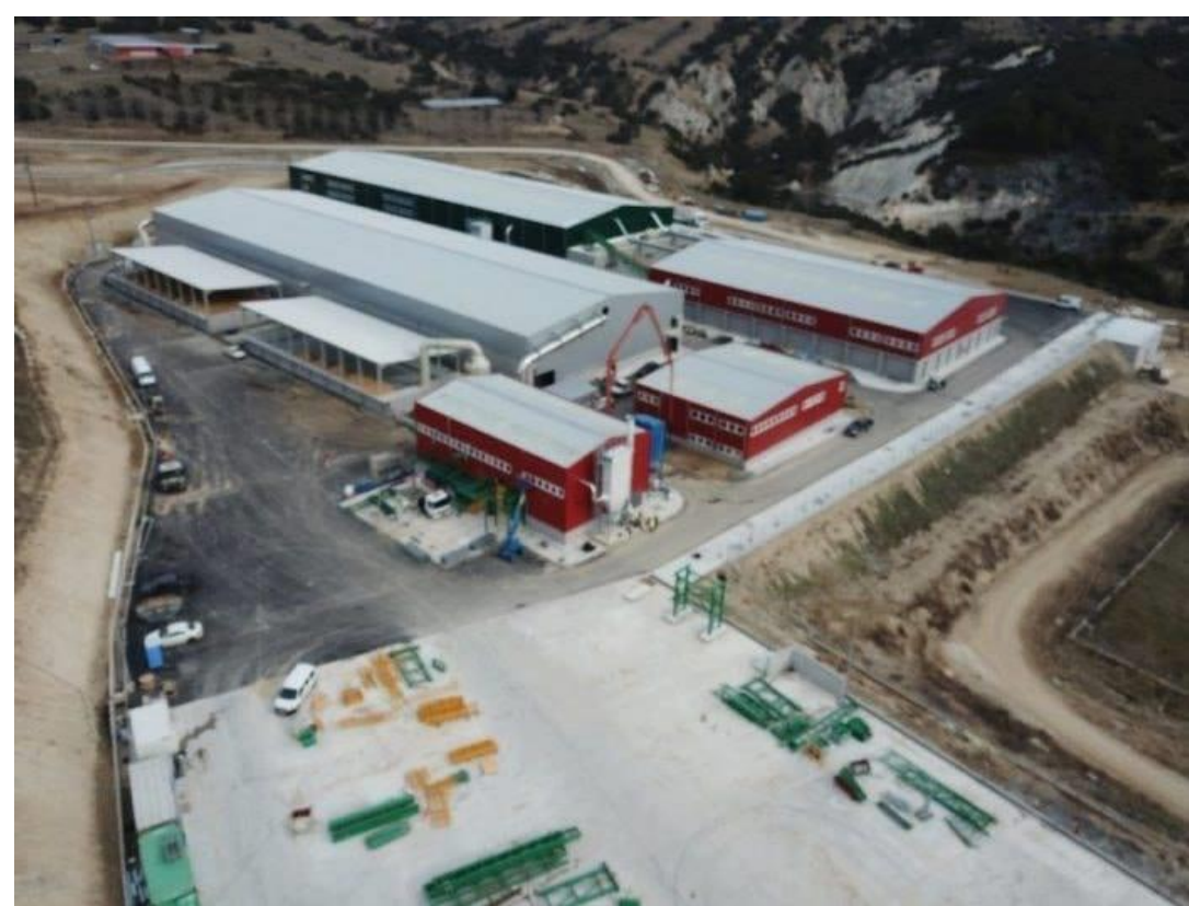
March 2019 – 21 months after contract signing