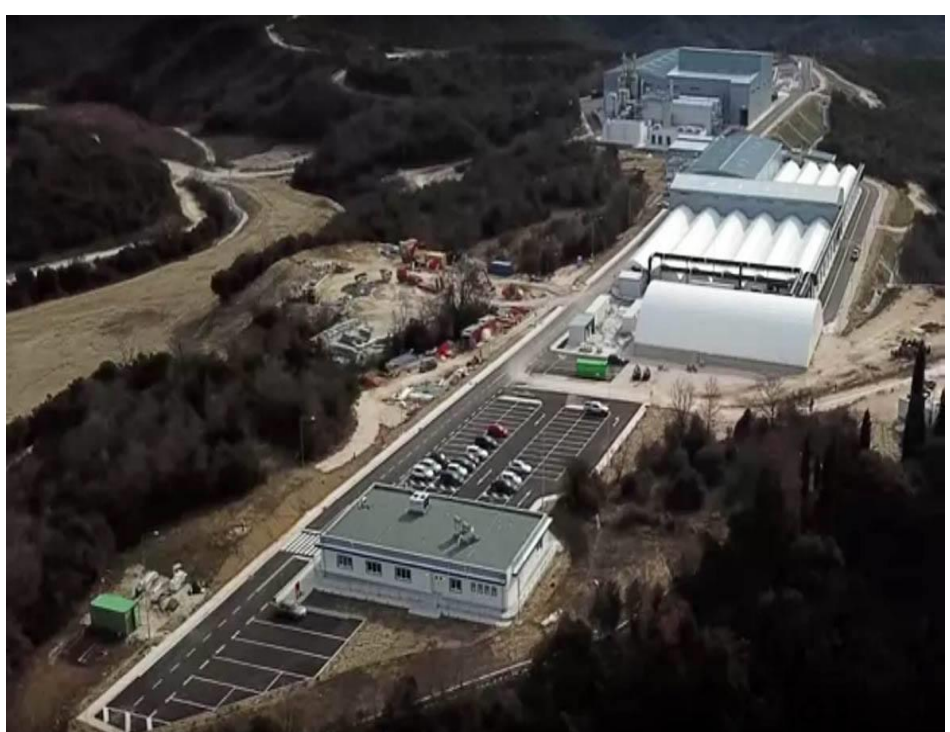
September 2017 – 2 months after contract signing