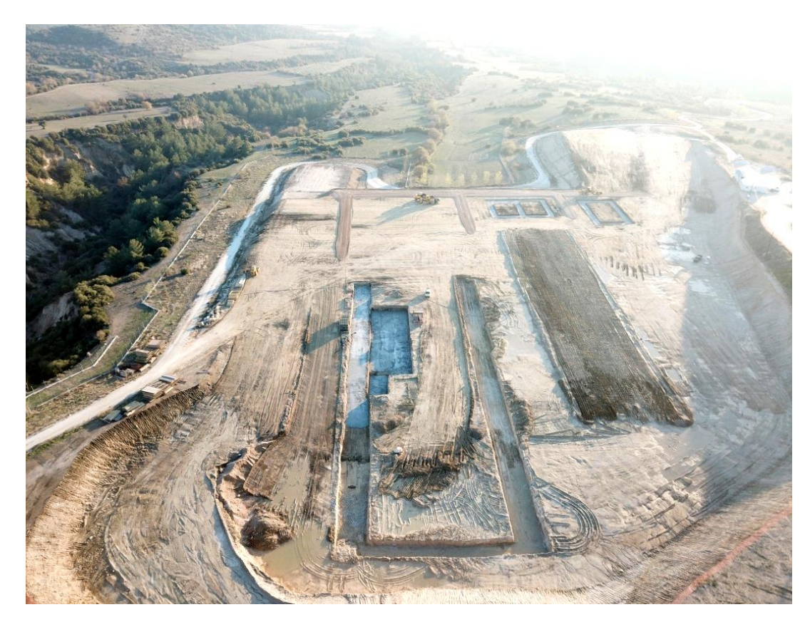
November 2017 – 5 months after contract signing