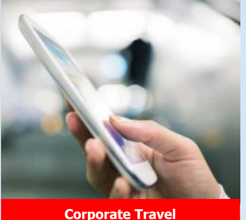
8 corporate travel agencies within

Our Charter Operations Division provides solutions for commercially licensed aircraft operators worldwide both for professional & leisure purposes