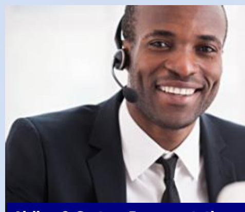
Airline & System Representation

12 Airlines in both Cargo & Passengers Services