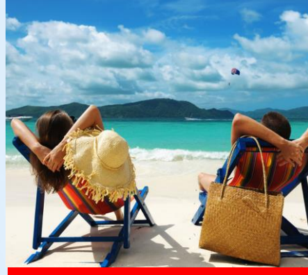
Leisure Travel Services

50% investment in ACSM (Air Cargo Services Madagascar)