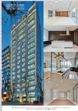
Page included in Platinum Sponsor