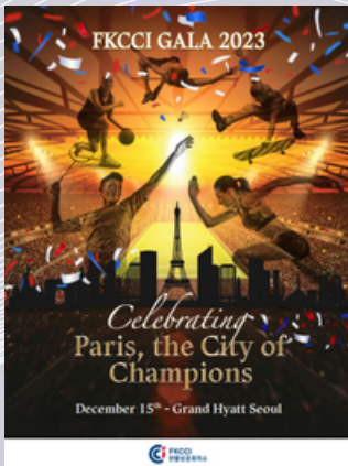
Front Hard Cover