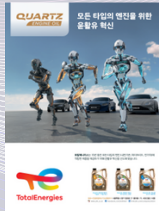
AD on the Front Hard Cover