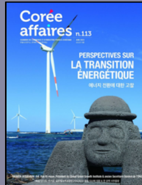
Corée Affaires 113: Perspectives sur la Transition Énergétique