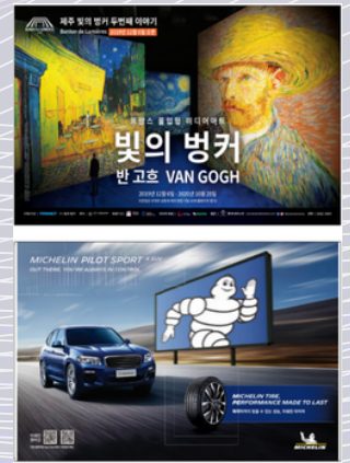
Page included in Gold Sponsor